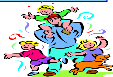
Fathers nurture/children obey

Clearly, we are under God's authority, yet He teaches, "Let every soul be subject to the higher powers. For there is no power but of God: the powers that be are ordained of God." (Rom. 13:1) We're also to be in subjection to these 'powers,' as authority is needed to maintain order and avoid chaos. God set guidelines for His institutions: marriage, government, and the Church, with specific structure and power as a "...minister of God to thee for good...". (Rom. 13:4)