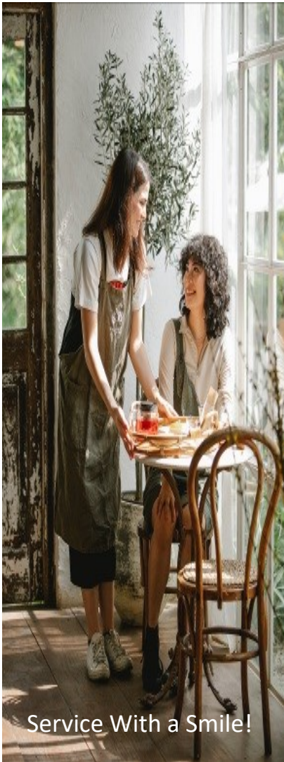
Service With a Smile!

Galatians 1:10 holds forth two questions as our help: “For do I now persuade men, or God? or do I seek to please men? for if I yet pleased men, I should not be the servant of Christ.” If we believe and are determined to be God’s servant, trusting Him, there is help. What does service look like when we are in affliction? We would continue to minister to others with charity, but only God can do it in us as He leads! “For as many as are led by the Spirit of God, they are the sons of God.” ( Romans 8:14 )