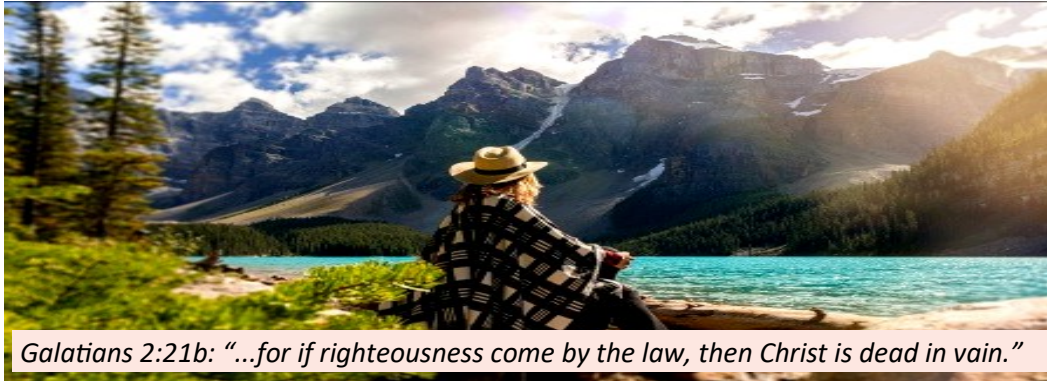
Galatians 2:21b: "...for if righteousness come by the law, then Christ is dead in vain."