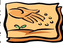
Sowing and Reaping

(Look for a spiritual mentor within the Body of Christ to assist, if you need a little help.)